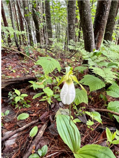
White Lady Slipper graces a Loon Lake forest hillside

taken in both the North and South Basins in June, July, and August. It's a great opportunity to be out on the lake, and anyone interested to learn how we do this and handle some of the sampling please contact Stuart at goodlux2@gmail.com .