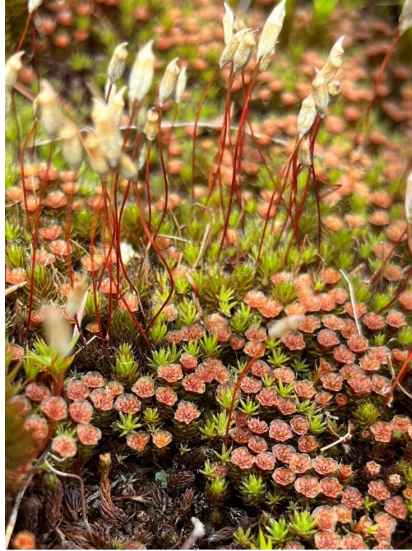
Bristly Haircap mosses (Polytrichum piliferum) blooming on the former Loon Lake golf course.