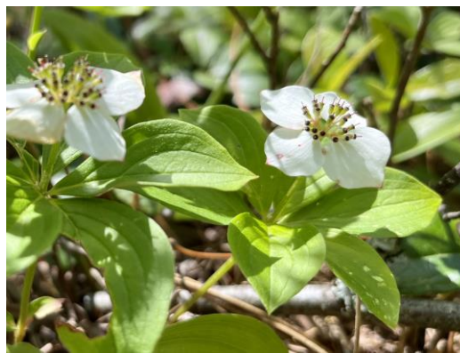
Bunchberry (Cornus canadensis) blooming through May and June at Loon Lake

We have also created a “Welcome Letter” for new residents. A copy is attached to this Newsletter and posted on the Loon Lake Bulletin Board. Printed copies can also be found in the Loon Lake Lending Library and at the Jewish Center. We hope this will help members to reach out to new neighbors, welcome them to the lake, and introduce them to the LLHOA and its role in helping protect our beautiful lake!