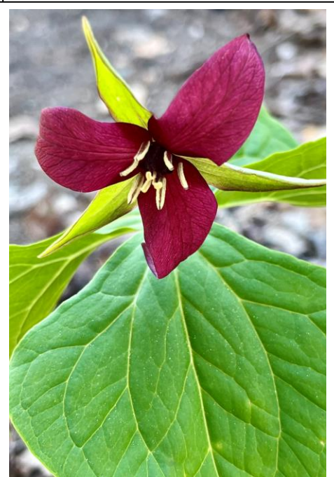
Red Trillium (Trillium erectum) seen around Loon Lake in early May

Thank you to everyone who contributed to the Lake Steward Fund! We reached our goal, and a steward is now on duty Friday through Monday, 9:30am to 6pm, until Labor Day. Thanks for your support!