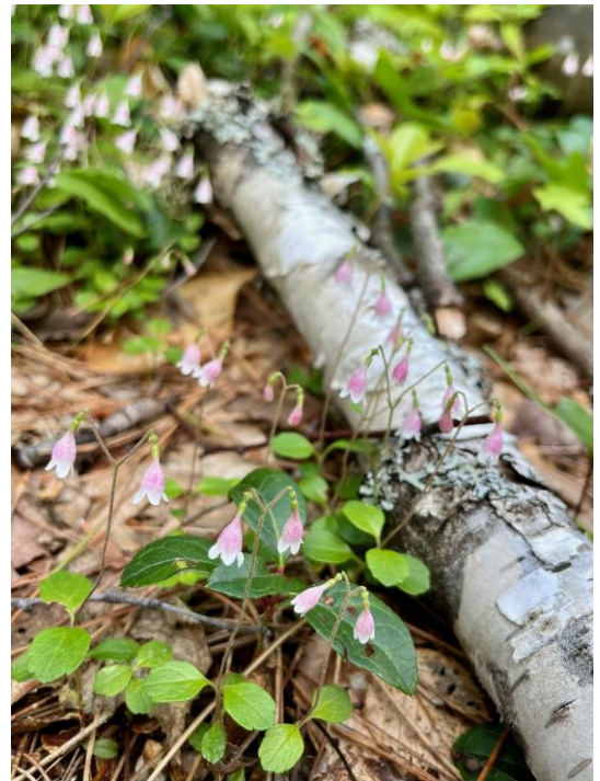
Twinflower (Linnaea borealis) arrived mid-June at Loon Lake this year.