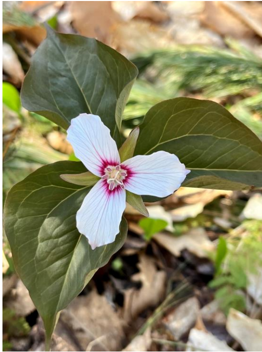
Painted Trillium (Trillium undulatum) near Loon Lake in early May